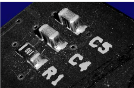
3D scan of small PCB components with grey overlay